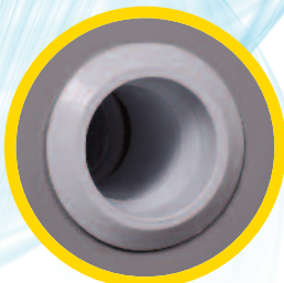
Standard 25mm access port on all models