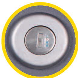
Door locks and additional space for padlocks on all models