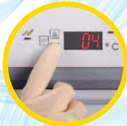
Digital temperature controller with intuitive interface